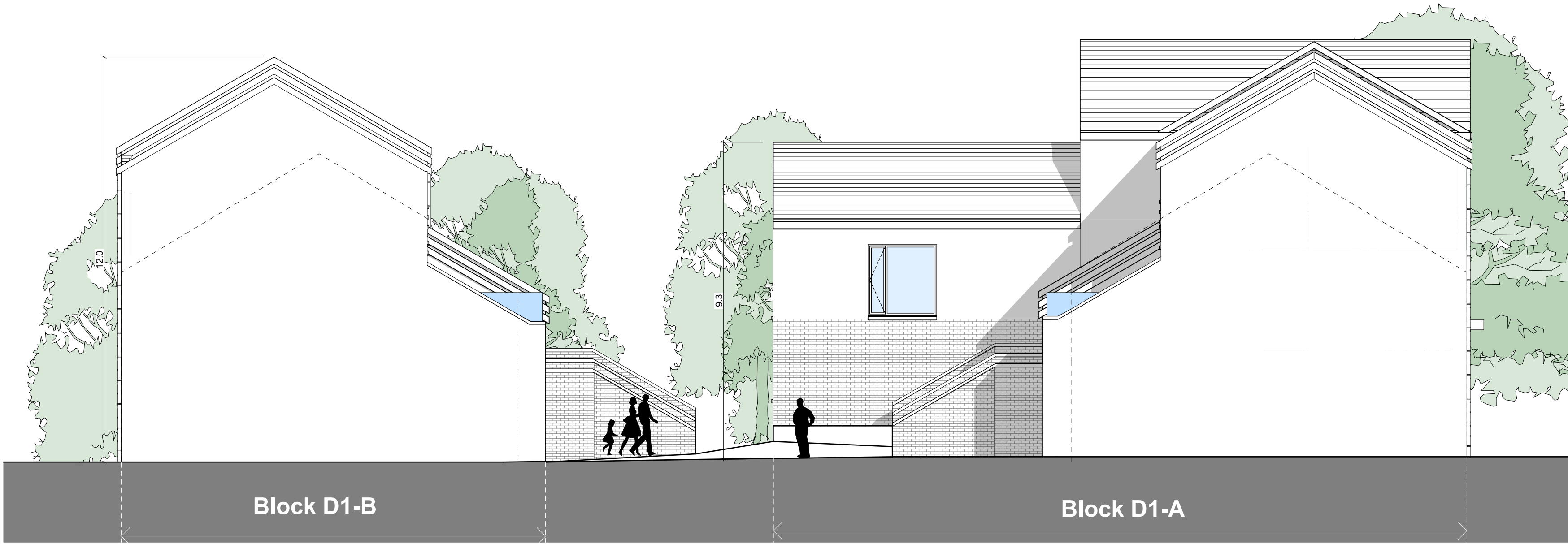
W4 North Elevation SCALE 1:100