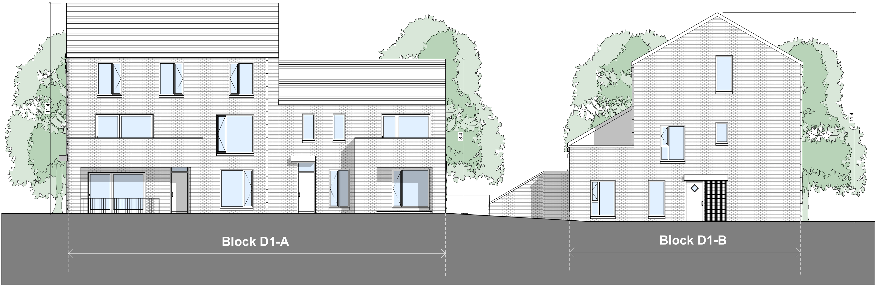
South Elevation SCALE 1:100